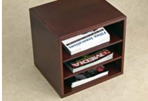
Shelves for Cube: Organize cube with optional shelves for added versatility. Adjust in 3/4" increments.