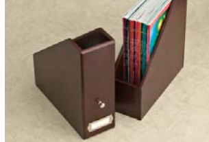
Magazine File: Store magazines and catalogs. Magazine files fit neatly into open cubes.