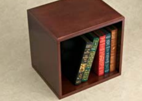
Cube: Provides storage for books, catalogs and magazines. Measures 13-1/2" w x 13" h x 11-1/2" d.