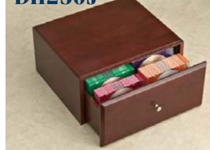
Stacking Media Drawer: Organizes 20" of CDs. 6-section divider system removes to store larger items.