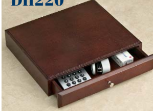
Stacking Drawer: Inner dimension is 11-5/8" w x 1-1/2" h x 10-1/2" d.