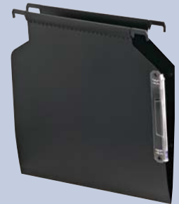
Hanging Shelf Files come with our unique magnifying lenses that make identifying files much easier.