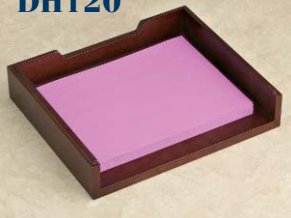
Stacking Letter Tray: Inner dimension is 12-3/8" w x 1-7/8" h x 11" d.