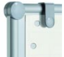
Flip-chart has holes for either landscape or portrait hanging.

Available Dual Position Flipcharts have pre-drilled corner holes so they can be hung in a landscape or portrait orientation. Dual Position Flipcharts come in a set of five 20-sheet pads with a grid and are 25 1/2" x 38 1/2". Each Whiteboard (sold separately from Uniflip Stand) comes with Flipchart Clips to hold Dual Position Flip-charts.