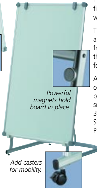
Powerful magnets hold board in place.