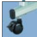
Add casters for mobility.