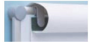
Flipchart pages conveniently tuck behind the board.

The patented hanging mechanism makes mounting easy and guaranteed to be level. Sturdy corner guards position the board 3/4" away from the wall so that already viewed presentation pages may be tucked behind, keeping your flipchart presentation intact for future meetings. Injection-molded clip-on marker tray can be positioned anywhere along the bottom channel of the frame.