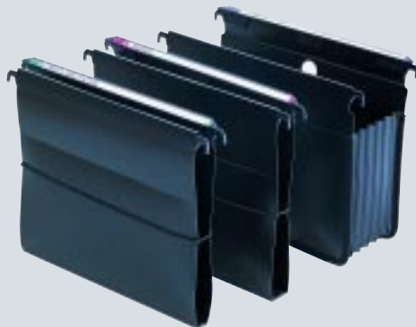
MAGNifiles Box-Bottom and Expanding Hanging Files

Access Desksets let you store papers, forms and accessories that typically clutter your desk. Choose open front drawers to see what each drawer contains, or closed for neat, hidden storage.