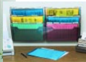
Two 3-Compartment Files shown side-by-side.

Wall Files are the perfect choice when desktop space is limited. The 3-Compartment File is perfect for mounting above a desk or wherever wall space is limited. Mount multiple units side-by-side for increased capacity. Measures 13" w x 14 1 / 2 " h x 8" d.