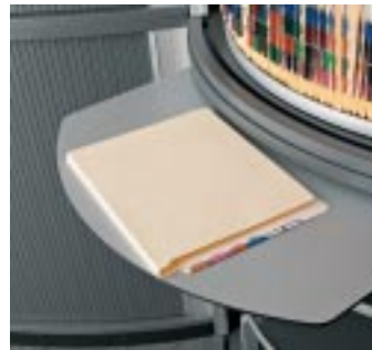
Pull-out Shelf provides an instant workspace to browse files.