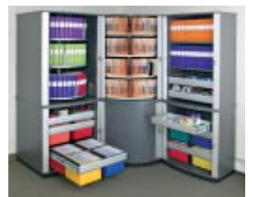
Check out the entire line of Access™ Cabinets to create a custom storage system for binders, files, media and more.