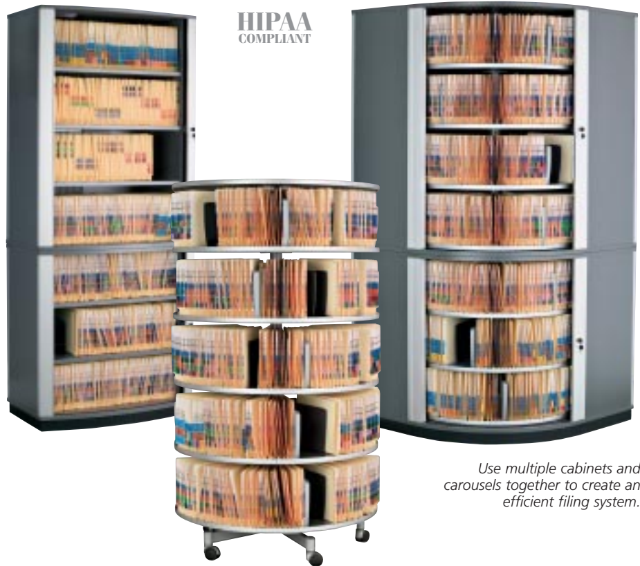
Use multiple cabinets and carousels together to create an efficient filing system.