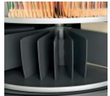
Organizer Set holds end tab files upright on a carousel shelf.