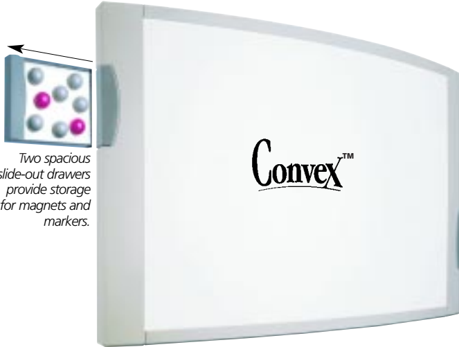
Two spacious slide-out drawers provide storage for magnets and markers.