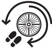
Each tier rotates independently from each other.

Available in wall and corner units, each independently rotating tier in the Carousel Cabinets provides the benefits of 6½' of binder storage. Optional accessories can hold books, charts, soft-bound documents and e-media.