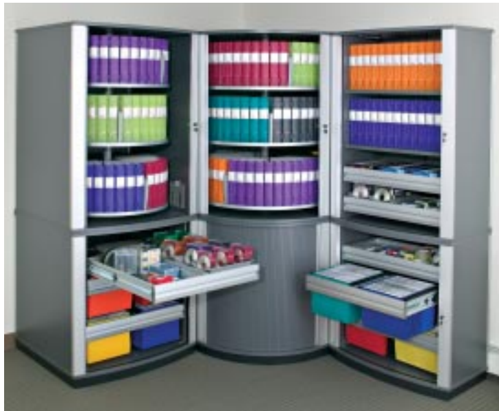
Store media, binders, files and more in one set of cabinets by adding drawers and/or hanging file rails.

Media Boxes organize CDs and other media on shelves, in a drawer or hanging file frame.