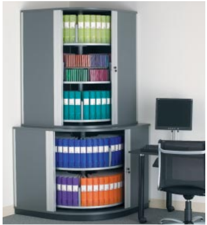
Corner units create storage space in unused corner areas in an office.