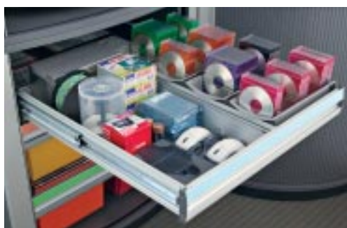
Divider Drawers have adjustable dividers to organize contents and are great for media and office supplies.