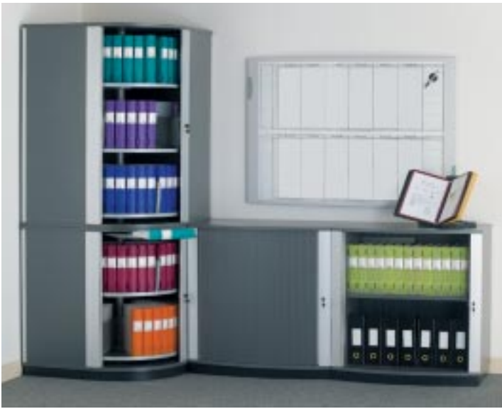
Combine units to separate office space or to create a compact, efficient storage system. Two tier cabinets are the perfect height to create counters or credenzas.