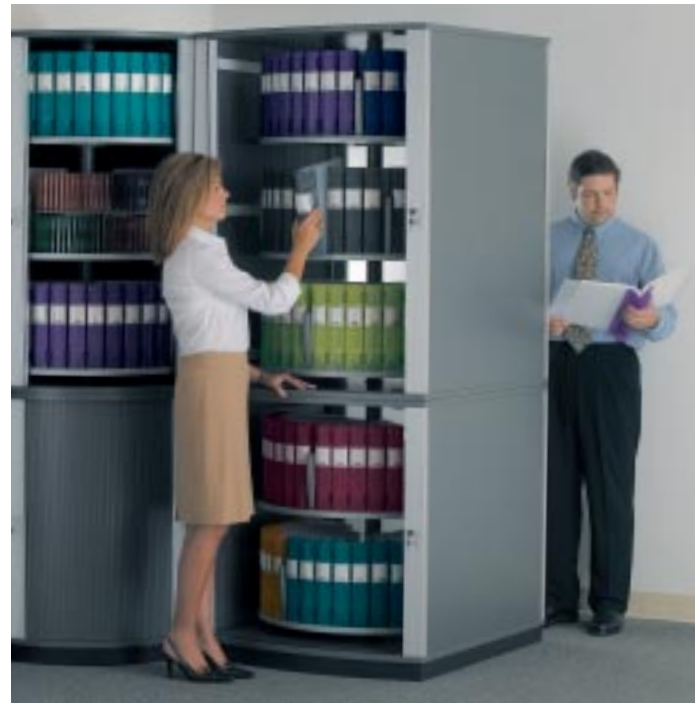
Double-Sided Cabinet is ideal for dividing office space.

Shelf Cabinets can be used as counters, credenzas or as linking elements when creating banks of cabinets. The shelf cabinets will store Magazine Files, end-tab files, Binders, TierDrop and DocuMate organizers.