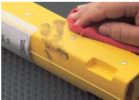
Durable — Grease and dirt wipe off using any industrial or household cleaner.