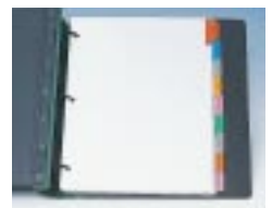
Extra Room for Index