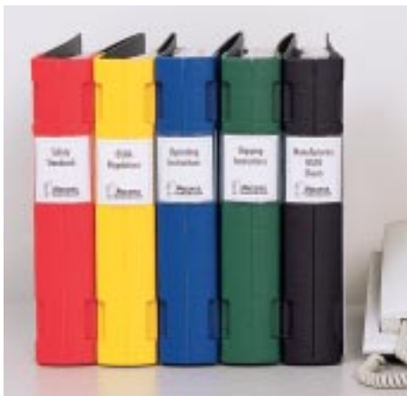
Versatile — 5 colored spines allow for easy color-coding and quick identification.

BestBuilt Binders are the perfect choice when durability and functionality are mandatory. They're great for storing safety standards, emergency procedures, operating instructions, shipping charts, manufacturer's MSDS sheets and more.