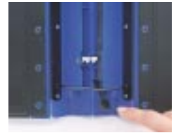
Finger Touch Trigger