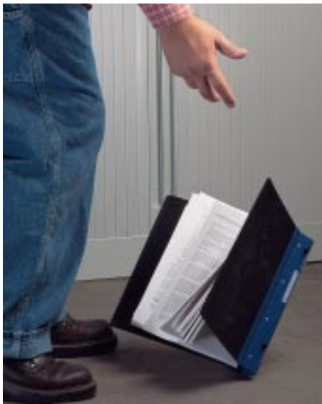
Sturdy — Overlapping rings stay shut so pages won't fall out, even if dropped.